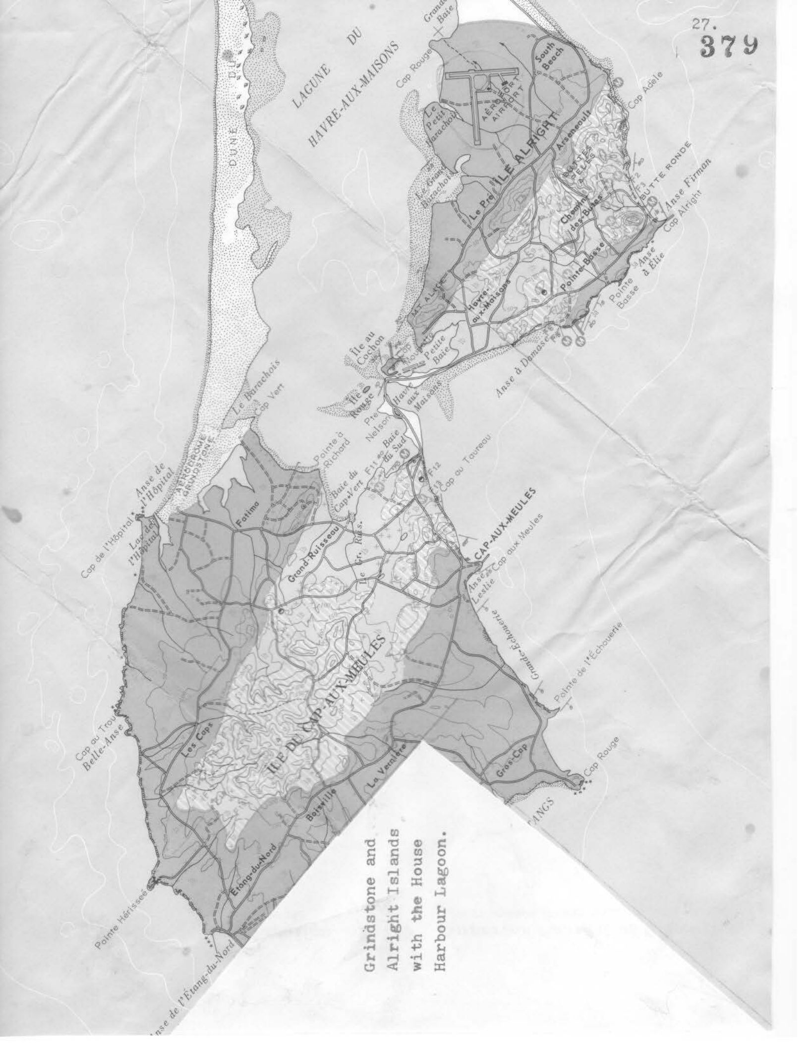
Grindstone and Alright Islands with the House Harbour Lagoon.