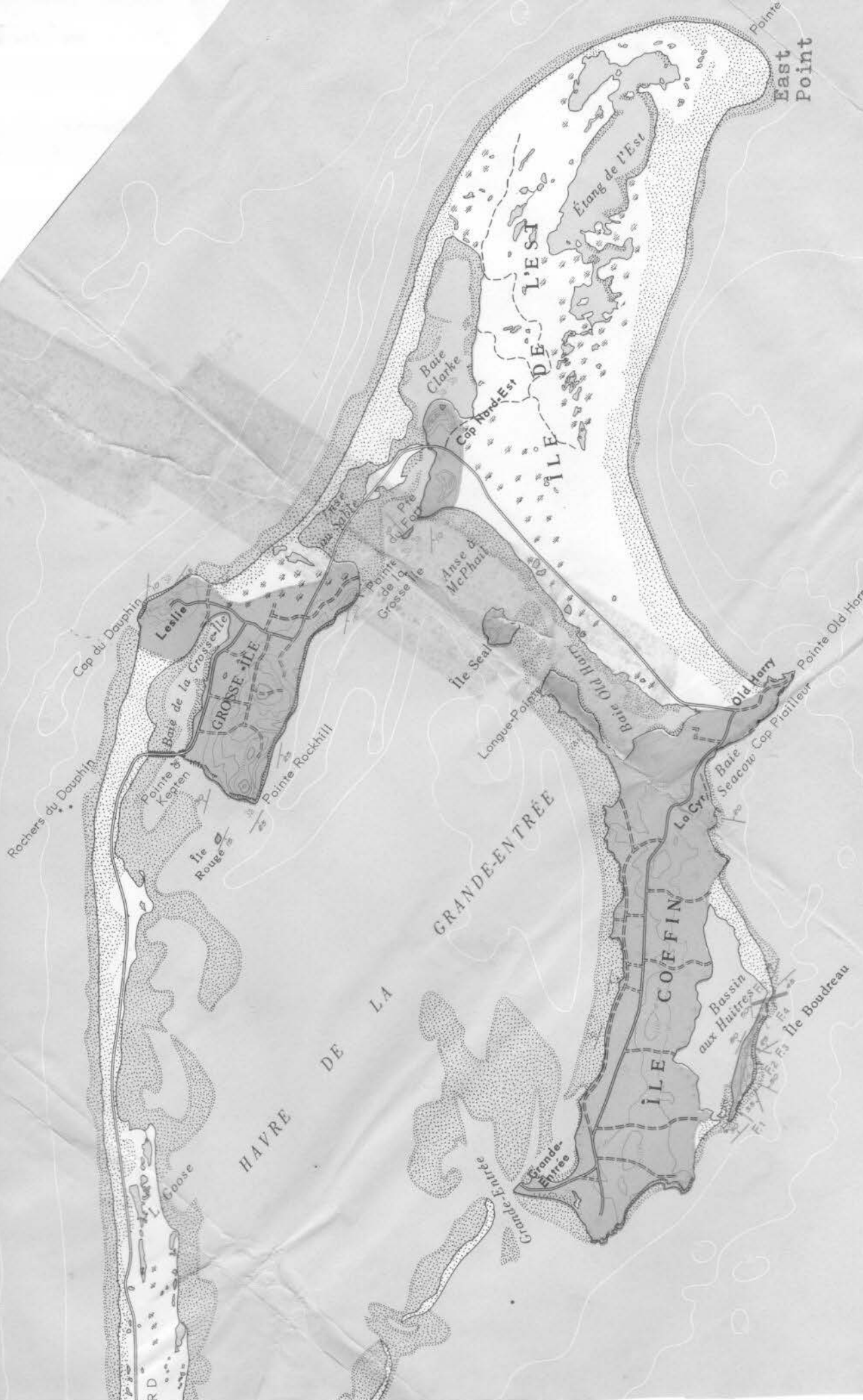
Grosse Isle and Coffin Island with the Grand Entrée Lagoon.