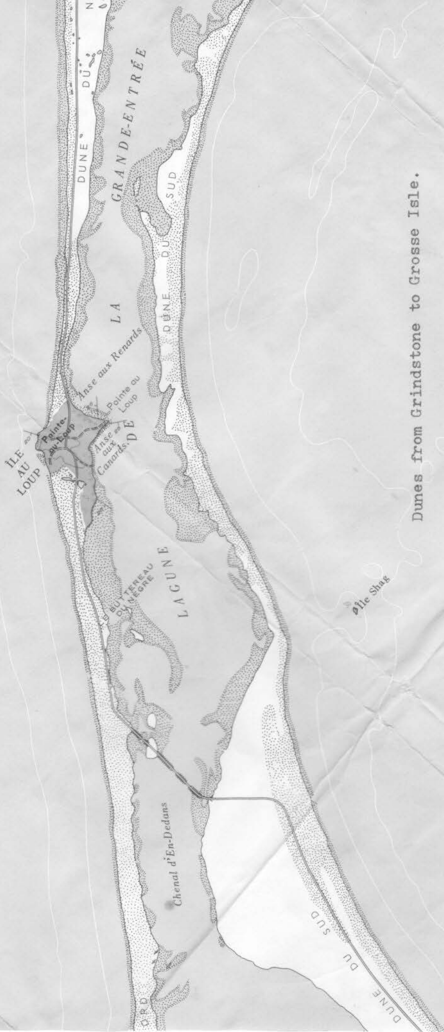
Dunes from Grindstone to Grosse Isle.